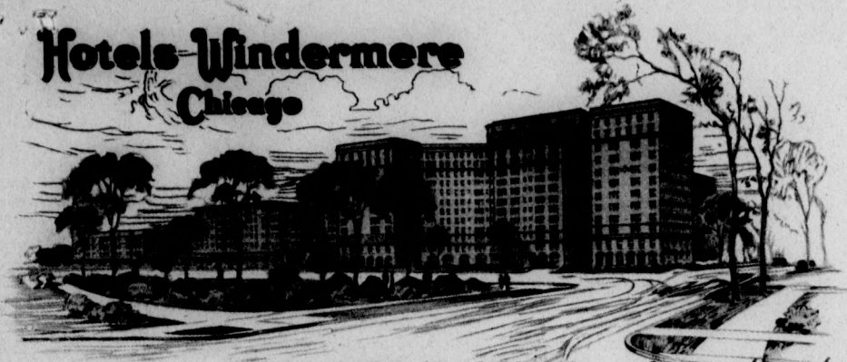
FRONTING SOUTH ON JACKSON PARK 56 11 STREET AND THE LAKE