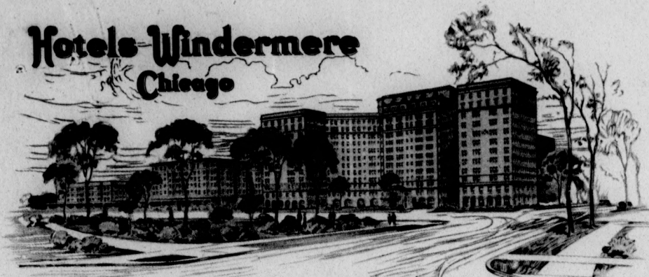
FRONTING SOUTH ON JACKSON PARK 56TH STREET AND THE LAKE