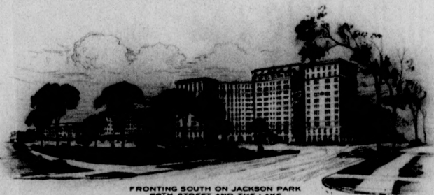
FRONTING SOUTH ON JACKSON PARK 5011 STREET AND THE LAKE