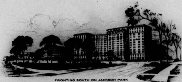
FRONTING SOUTH ON JACKSON PARK 56TH STREET AND THE LAKE