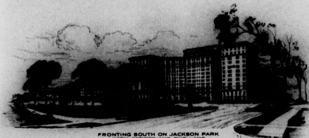
FRONTING SOUTH ON JACKSON PARK 5212 STREET AND THE LAKE