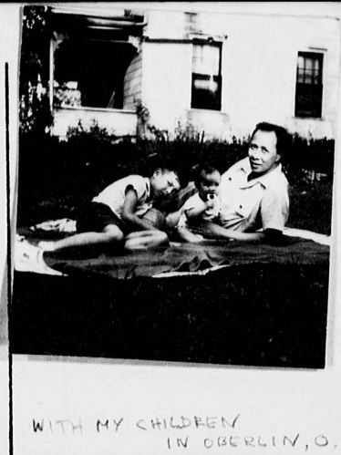
WITH MY CHILDREN IN OBERLIN, O.

25. EXTRA-CURRICULAR ACTIVITIES PLAYGROUND BALL, MOVING PICTURE CAMERA CLUB, SUMMER RECREATIONAL DIRECTORSHIP, LECTURING ON HAWAII AND CHINA,