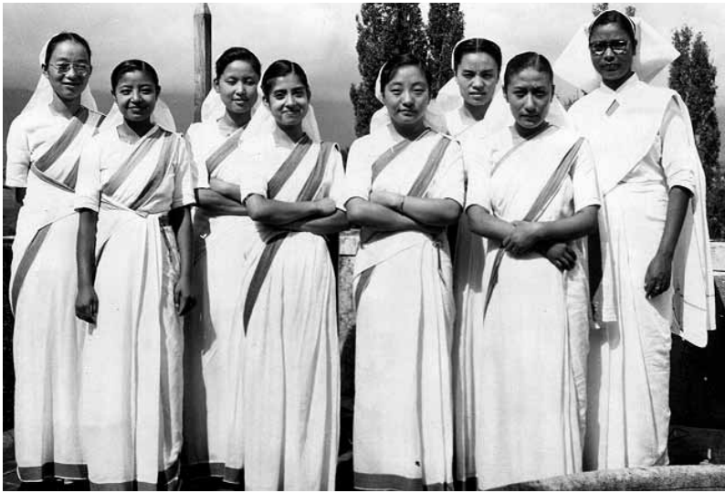
The first group of nursing students to graduate in September 1962.

The Nursing Campus remained closely linked with UMN until 2003. Separation from UMN was very painful, but it taught us how to implement past experiences we had learned from UMN. LNC grew and, in December 2003, became an autonomous institution with its own Board and Constitution. Many programmes were added, including a BSc and Masters in Nursing. In 2005 -2008, the campus across the street from the old Shanta Bhawan building was renovated and remodeled, with the kind support of the American School of Nursing Hospital Abroad (ASHA). UMN had initiated that application. Remarkably, the work was completed within a year! A new Bachelor of Nursing building was also constructed, thanks to FELM.