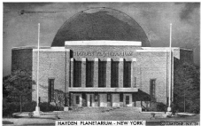
HAYDEN PLANETARIUM - NEW YORK