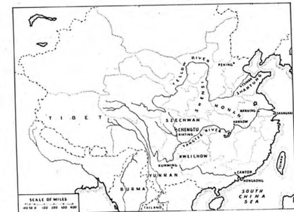
Fig. 1.—Outline map of China.

Canada ought to know about and be proud of the Kilborns, a Canadian family which for parts of three generations, from 1891 to 1963, served with distinction the cause of medicine and of higher education, in China and Hong Kong.