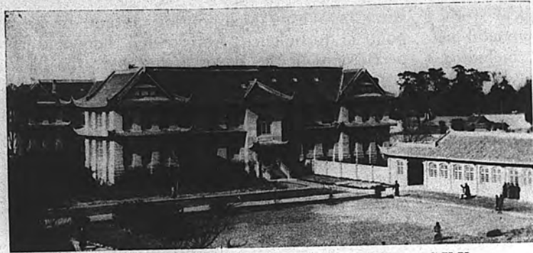
Fig. 4.—The College of Medicine and Dentistry, W.C.U.U.