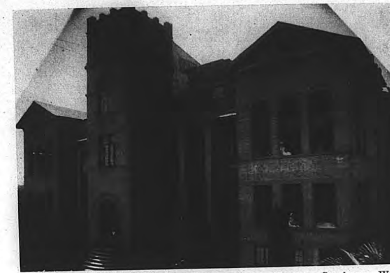
Fig. 6.—Hospital for Women and Children, Chengtu, Szechwan, West China (1932).

him bears enduring testimony. He was an expert linguist, a careful administrator, an able speaker, a constructive educator, a faithful friend. Most significantly of all for his work in China, he was implicitly trusted by the Chinese because of his unsparing devotion to their interests. He was the author of several books, including "Heal the Sick", a book on medical missionary work, published in Canada in 1910, and "Chinese Lessons", a book for first-year students of Chinese in West China, published in Chengtu in 1917. This last-named was the most important book used by all foreign students of the Chinese language in West China until the 1930's.